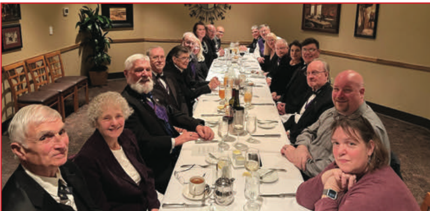
Knights Companions and ladies in attendance at the dinner following the installation.