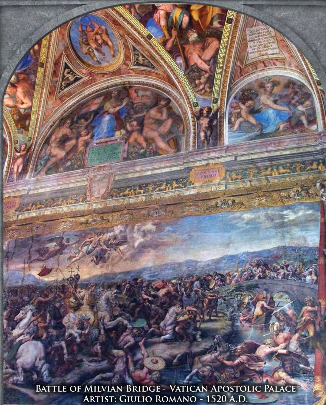
BATTLE OF MILVIAN BRIDGE - VATICAN APOSTOLIC PALACE ARTIST: GIULIO ROMANO - 1520 A.D.

UNITED GRAND IMPERIAL COUNCIL · RED CROSS OF CONSTANTINE