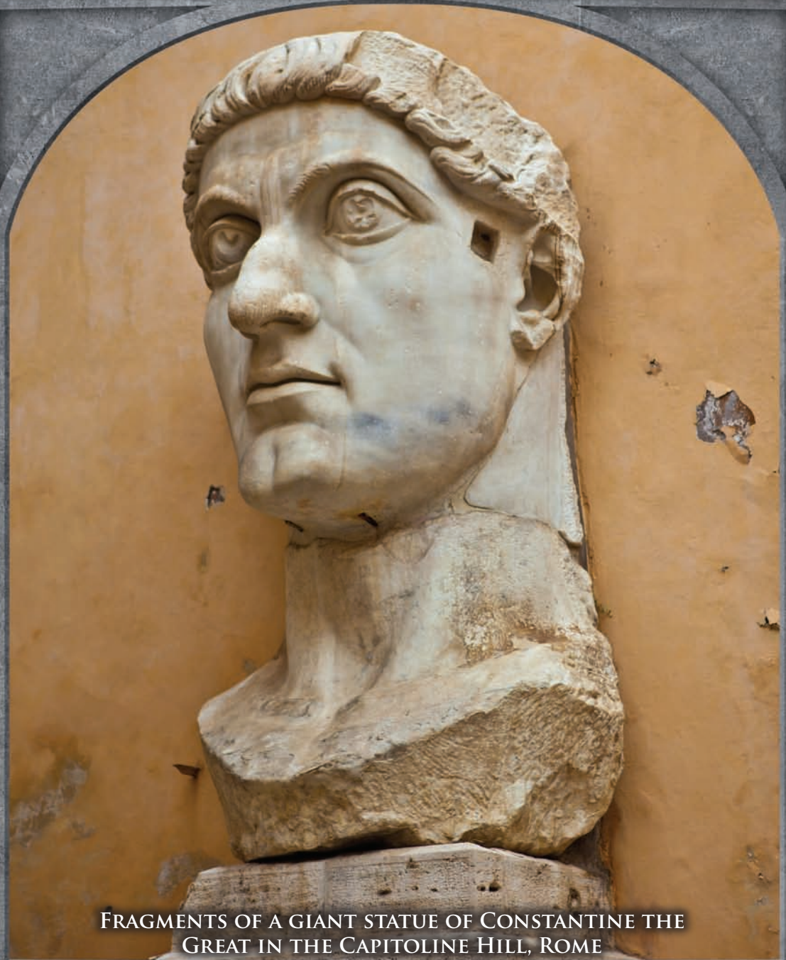
FRAGMENTS OF A GIANT STATUE OF CONSTANTINE THE GREAT IN THE CAPITOLINE HILL, ROME