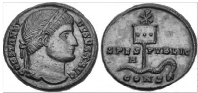
Follis of Constantine. AD 327 London. The British Museum

Thus, in AD 327, the mint of Constantinople, increased the striking of the follis, the bronze coin (see picture above) which featured, on the obverse, the effigy of Constantine and the inscription "CONSTANTINUS AUG MAX". On the reverse we can see the 'Imperial Labarum' with its three medallions (standing for the Emperor and his two sons) on top of which is set the Chrismon , whilst below we read the phrase "SPES PUBLICA CONS".