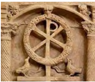
Sarcophagus of Anàstasis – detail 4rd century Rome. Musei Vaticani

In order for this new imperial strategy to achieve political legitimacy, the special relationship between the divinity had to become public knowledge. The minting and circulation of new coins, was both an official means of propaganda and a medium capable of reaching every region of the empire.